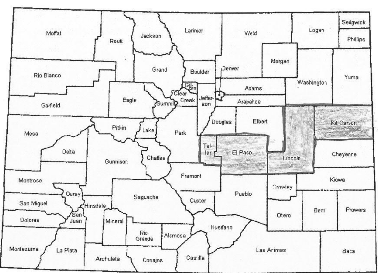
4<sup>th</sup> Judicial District in1965