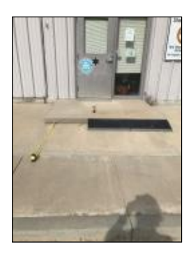
Finding 297746 Additional Photo