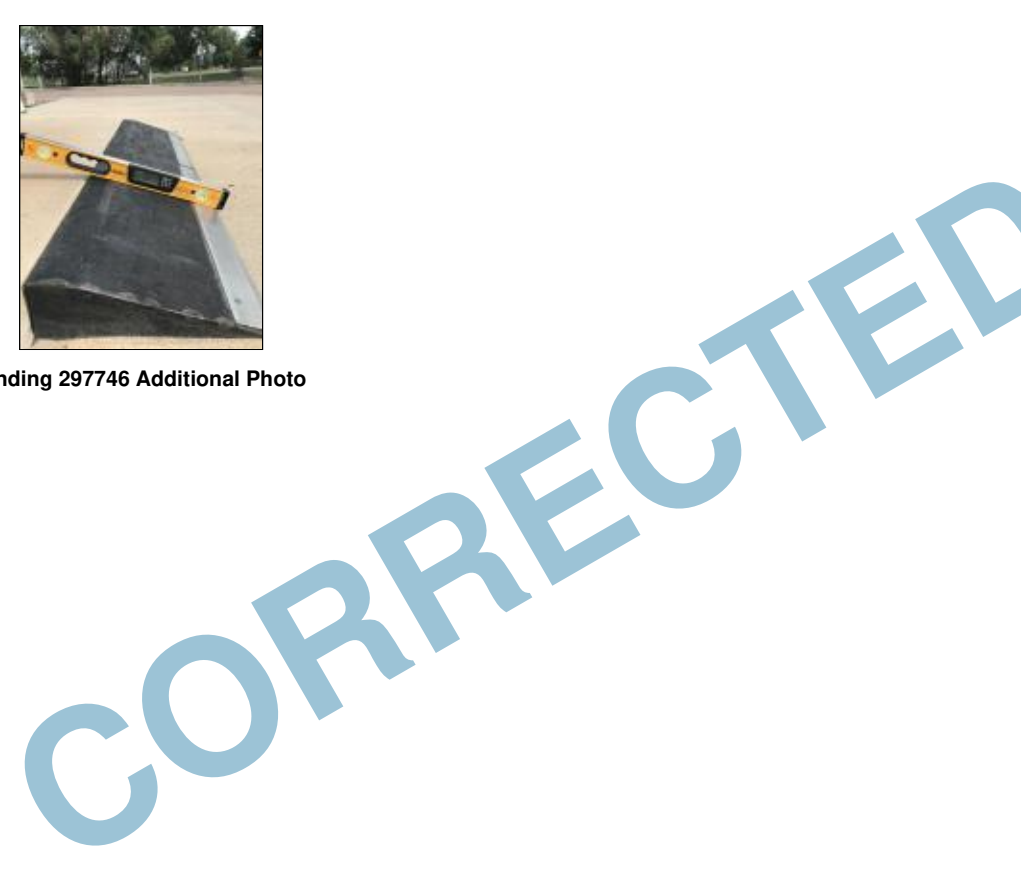
Finding 297746 Additional Photo