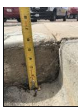
Finding 297747 Additional Photo