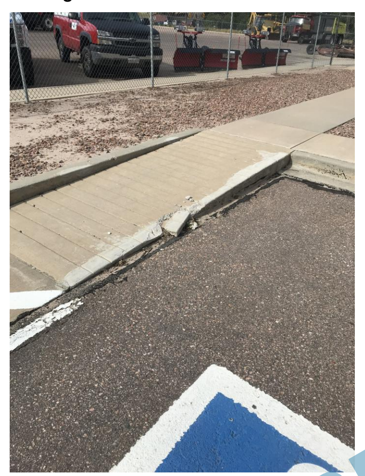
Finding 297747 Main Photo