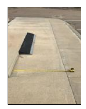
Finding 297746 Additional Photo