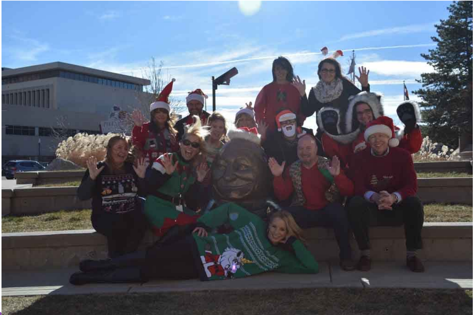
Office of the County Attorney