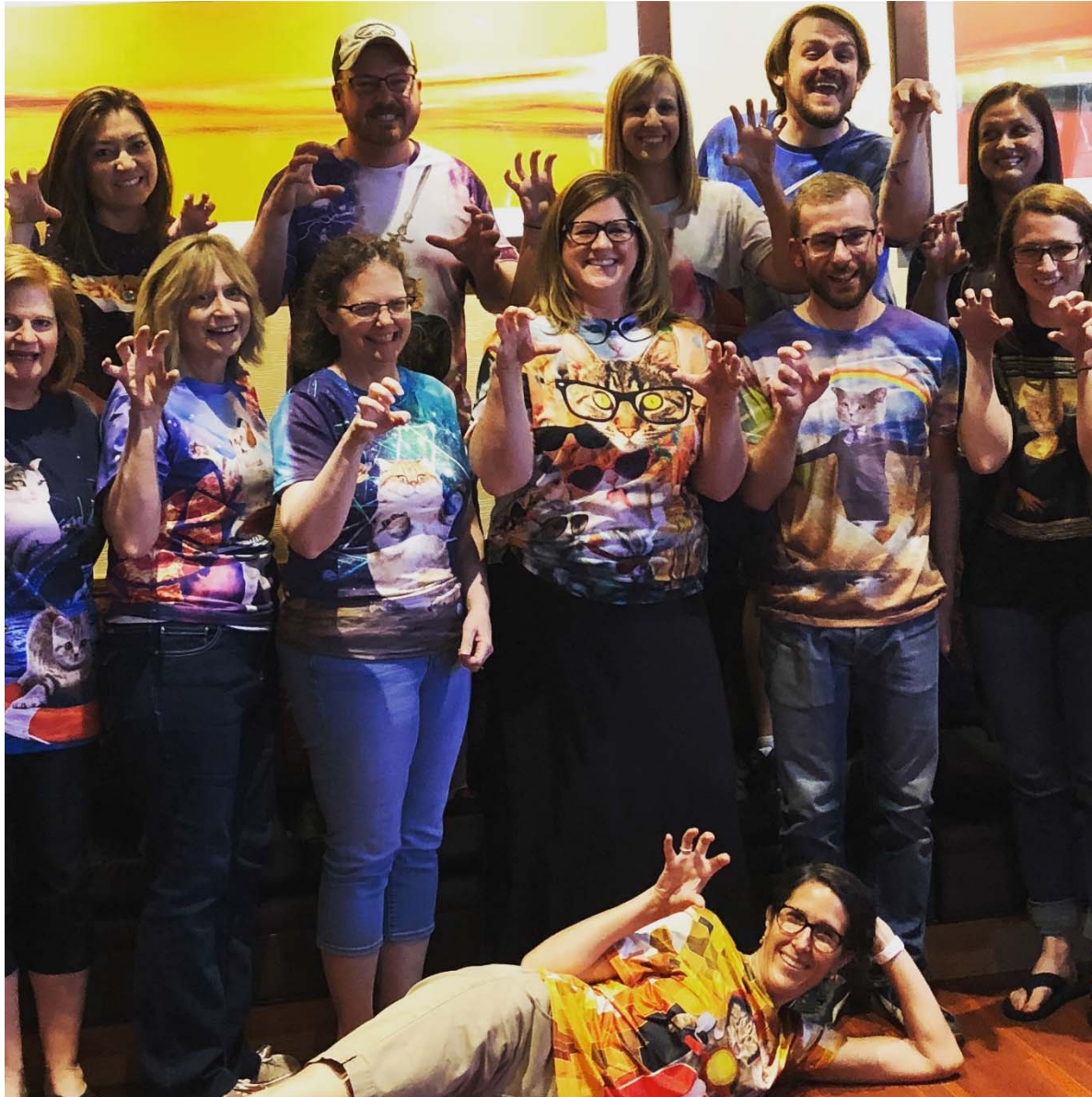
Office of the County Attorney