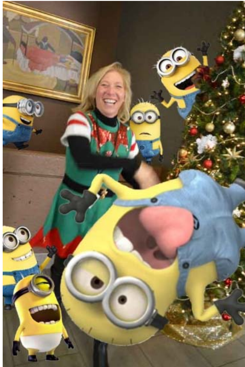
Office of the County Attorney